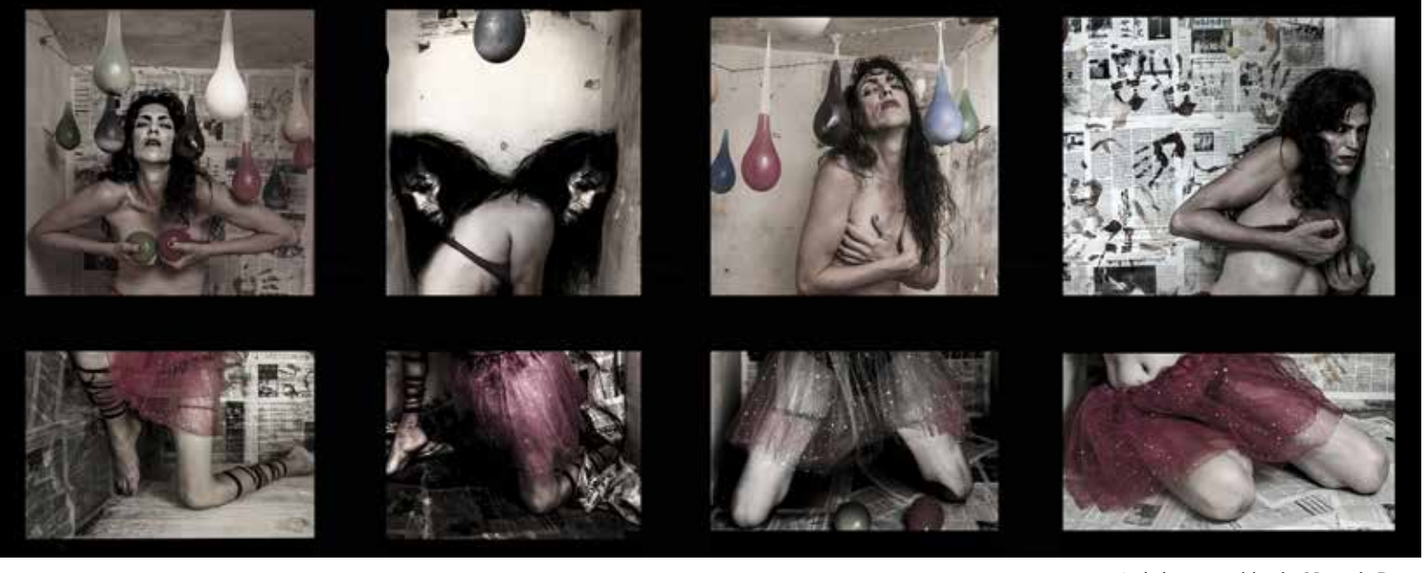
Artistic composition by Nonardo Perea